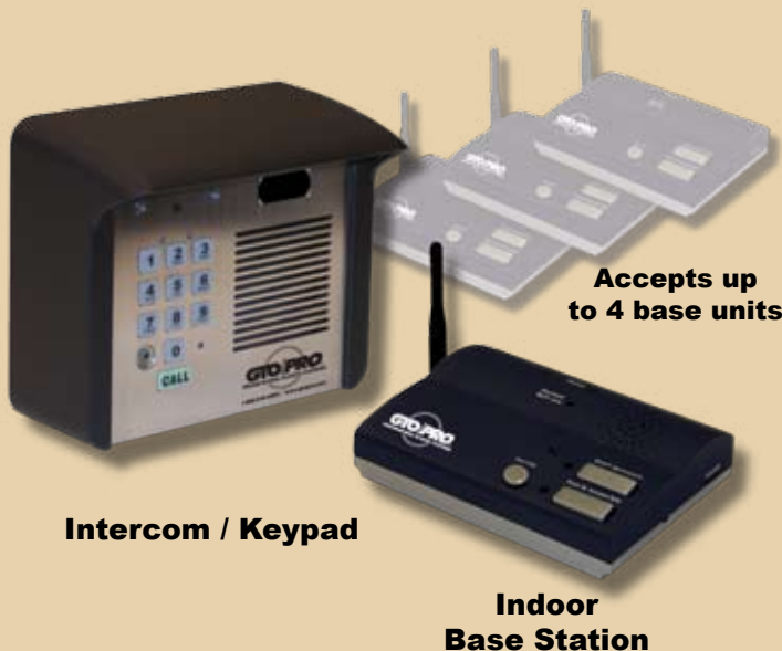
Intercom / Keypad